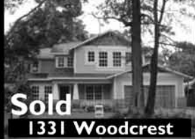
Sold 1331 Woodcrest