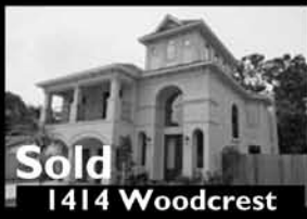
Sold 1414 Woodcrest