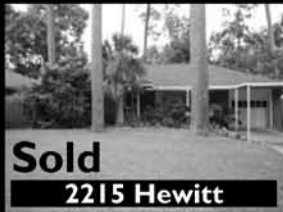
Sold 2215 Hewitt