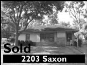
Sold 2203 Saxon