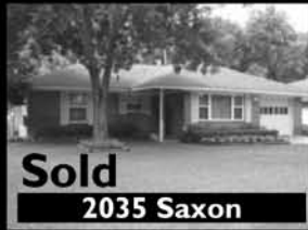
Sold 2035 Saxon