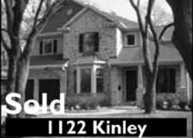
Sold 1122 Kinley

These are just some of the Oak Forest homes we participated in the sale of in 2007, thank you for an outstanding year! If you're looking to buy or sell a home let us show you the difference The Reyna Group makes.